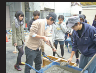
Pouring concrete during a building construction experiment [3rd year]