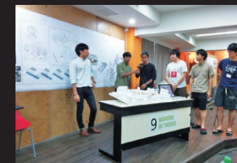
Environmental Design Workshop with Kasetsart University, Thailand