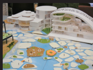
A Model produced by a student for Architectural Design I [3rd year]