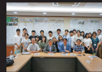
Collaboration Workshop with School of Architecture, Hankyong National University in Korea