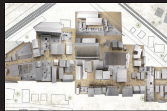
Models of outstanding works produced during Special Research [graduation designs] [4th year]