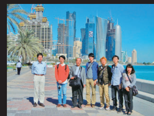
Special Research [graduation thesis] [4th year] Surveying high-rise buildings in Doha, Qatar