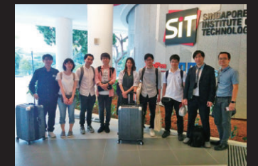
Collaboration Research Investigation of Green Building with Singapore Institute of Technology