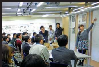
Presentation of designs produced for Architectural Design Drawing II [2nd year]

I Introductory subjects B Basic subjects AP Applied subjects AD Advanced subjects