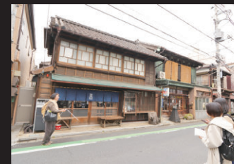
Design Survey on a historic townscape (Urban Planning)